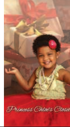
Princess Chloe's Closet

917-721-7350 princesschloescloset@yahoo.com princesschloescloset.storenvy.com